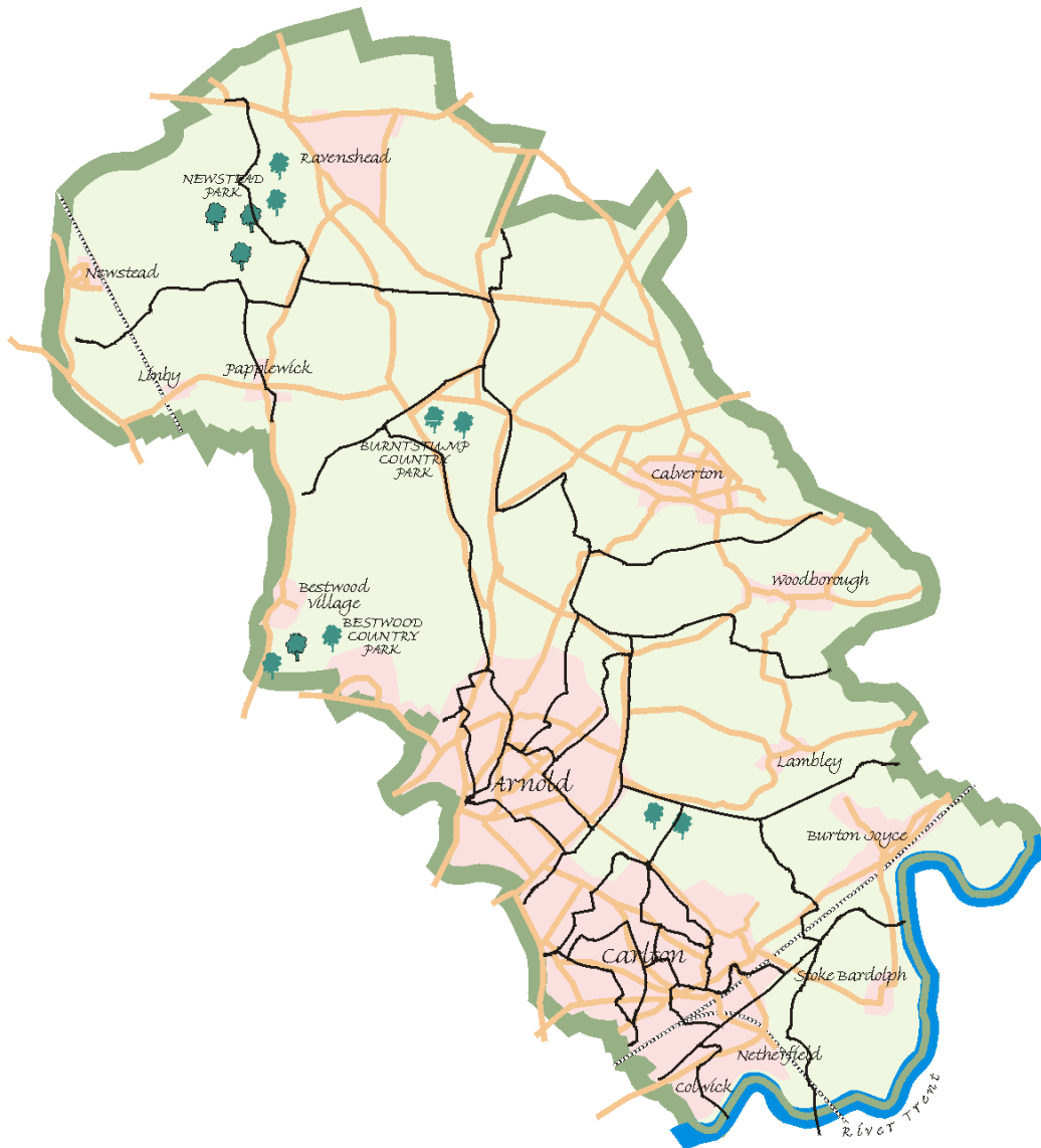
Map of Gedling area