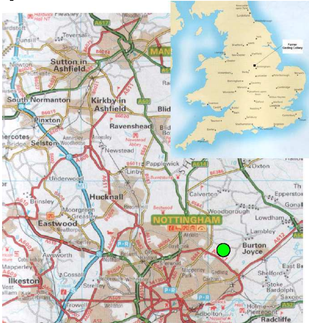
Figure 01: Location Plan

Reproduced with the permission of the Controller of H.M.S.O. Crown copyright, Licence No. LA100021246. Unauthorised reproduction infringes Crown copyright and may lead to prosecution or civil proceedings.